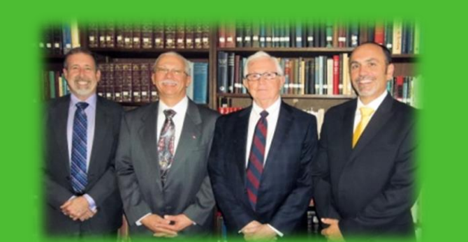
Overseesing Eldership North Main Street Mocksville, NC